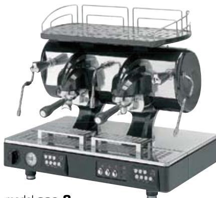
model sae 2