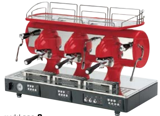
model sae 3