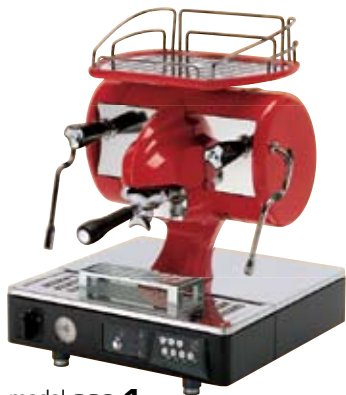
model sae 1